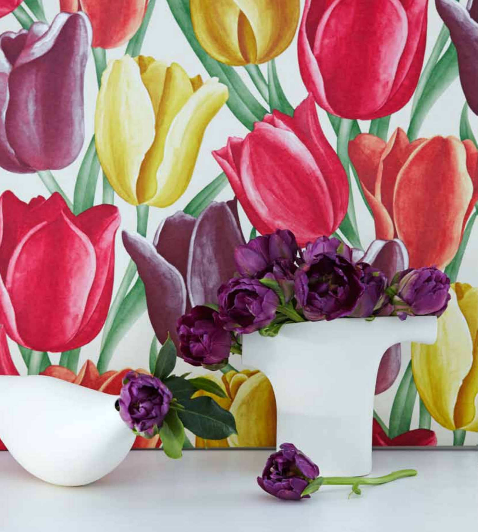
This page: Liz Stops 'Horizontal Form Bird' vessel, $231, Liz Stops tall vessel, $132, both Planet Commonwealth. Tulips, from $33/bunch, camelia foliage, $30/bunch, both Garlands. Background in Sanderson Vintage 'Early Tulips' wallpaper, $150/10-metre roll, Domestic Textiles. Opposite page, on table: Violets, $15/bunch, pilea foliage, $24/bunch, both Garlands. Cut-glass vases, seek similar from Peter's of Kensington. Lab flask, $30, '250' lab flask, $45, both Seasonal Concepts. Driade 'Diamante' glass, $145/jug and glass set, Spence & Lyda. Living Divani 'Bolle' coffee table with four cylindrical tops in White, $1905, Space. 'Hydrangea' mauve velvet armchair, $2200, Edit. 'Winona' ballet flats in Silver, $89.95/pair, Country Road. Tote bag in Glossy Leaves, $80, Edit. Stockists, page 211